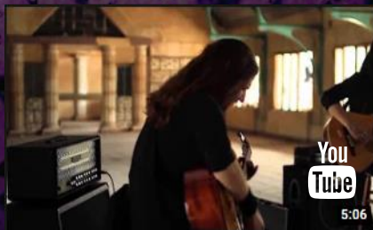
VISIONS OF PAIN Mar 2014