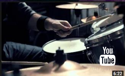
A VIOLENT MOTION Mar 2013

New Album first music video , with very positive reception internationally Nov 27, 2020